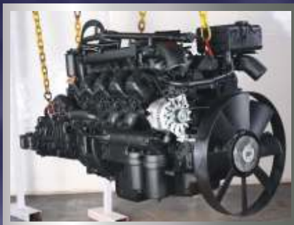
Twin Turbocharged V8 Engine with Intercooler