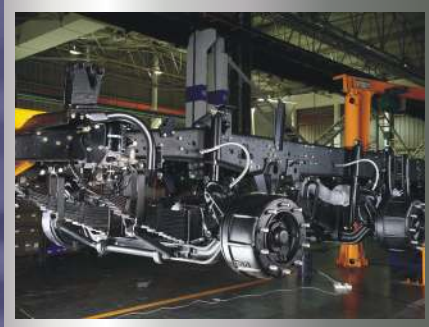
8x4 Drive with Integrated Axle Design