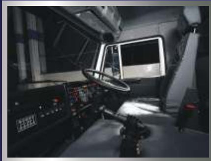
Fully Built Tilttable Cab

Market leader from Russia - Now in India.